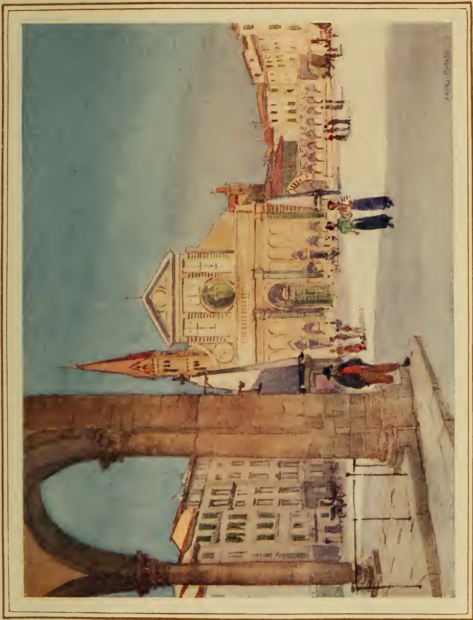
S. MARIA NOVELLA AND THE CORNER OF THE LOGGIA DI S. PAOLO